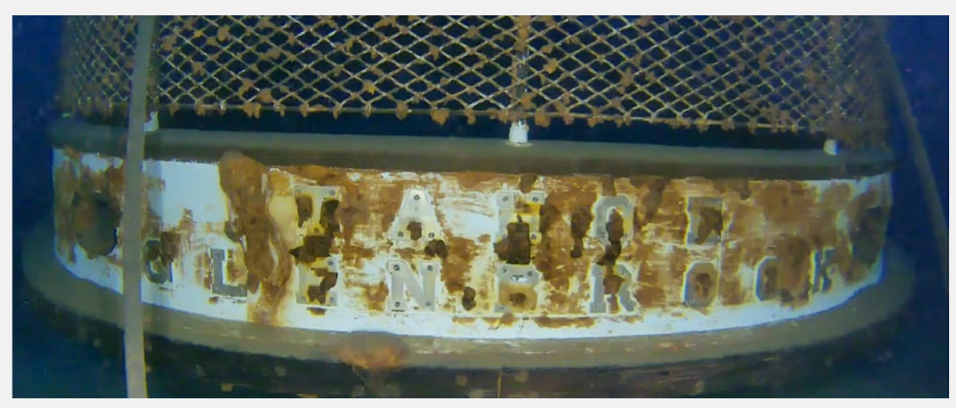
Figure 1. Photo of a shipwreck taken from the OpenROV Trident

To achieve underwater video and recording, each OpenROV Trident is equipped with a built-in camera that produces multiple video streams. These streams are transmitted through the tether and then bridged to an operator's device via Wi-Fi. The vehicle's software is tasked with maintaining the balance between delivering low-latency, high-quality video, and working with the bandwidth and reliability constraints that the physical network imposes on the system. Additionally, due to the high-cost nature of underwater and maritime operations, reliability and robustness of both the physical vehicle and its software are of paramount importance. Even with traditional ROV equipment, which can cost hundreds of thousands to millions of dollars, the cost of the sensing equipment typically pales in comparison to the operational and personnel costs. In this context, Trident was designed to be cost-effective, fast and effective to deploy and use, and highly reliable when collecting valuable mission data. These requirements resulted in the need for an advanced connectivity solution.