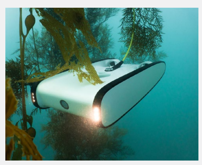
Figure 2. A photo of the Trident captured during an underwater dive

RTI's connectivity software enables OpenROV to ensure that all videos and telemetry captured by the Trident are simultaneously streamed live to the operator's device and recorded locally onboard the vehicle, as well. This means that the user always has a redundant source of mission data, in the event that the vehicle is lost or damaged while a mission is underway. Additionally, the flexibility of the pub-sub architecture allows the video delivery software to optimize the livestream's bandwidth for multiple operators, while delivering