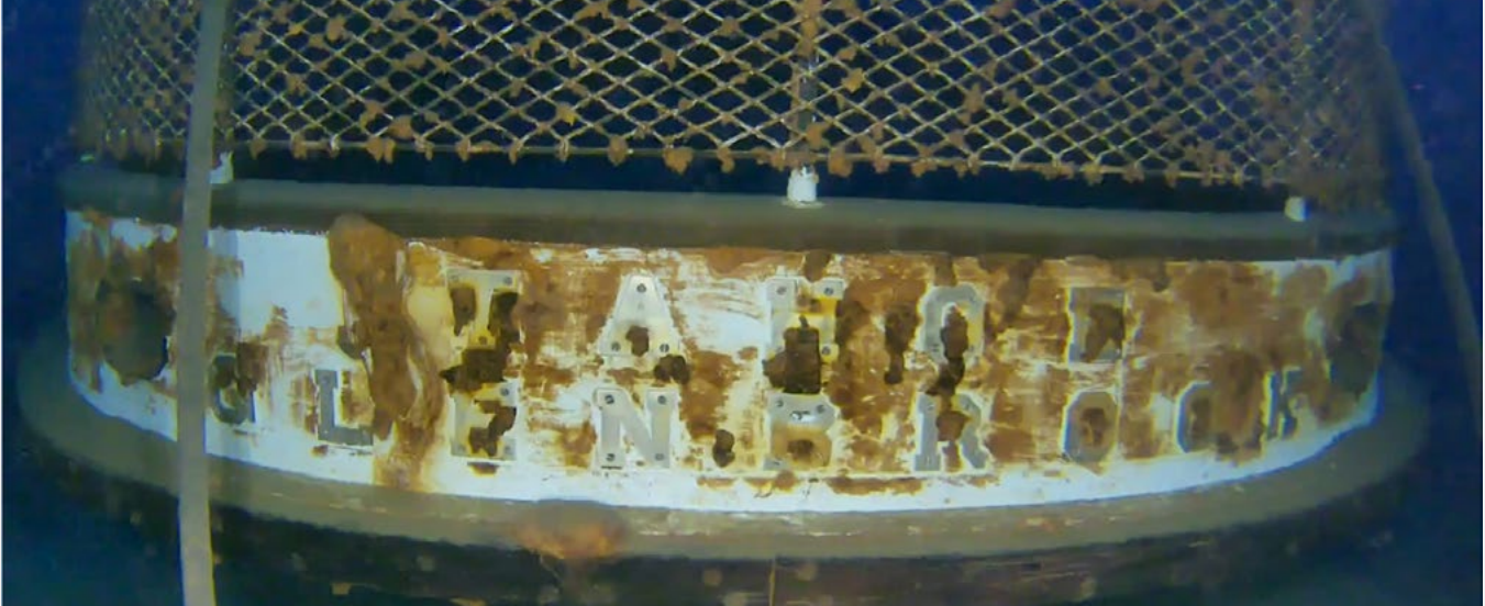
Figure 1. Photo of a shipwreck taken from the OpenROV Trident

To achieve underwater video and recording, each OpenROV Trident is equipped with a built-in camera that produces multiple video streams. These streams are transmitted through the tether and then bridged to an operator's device via Wi-Fi. The vehicle's software is tasked with maintaining the balance between delivering low-latency, high-quality video, and working with the bandwidth and reliability constraints that the physical network imposes on the system. Additionally, due to the high-cost nature of underwater and maritime operations, reliability and robustness of both the physical vehicle and its software are of paramount importance. Even with traditional ROV equipment, which can cost hundreds of thousands to millions of dollars, the cost of the sensing equipment typically pales in comparison to the operational and personnel costs. In this context, Trident was designed to be cost-effective, fast and effective to deploy and use, and highly reliable when collecting valuable mission data. These requirements resulted in the need for an advanced connectivity solution.