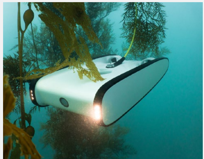
Figure 2. A photo of the Trident captured during an underwater dive

RTI's connectivity software enables OpenROV to ensure that all videos and telemetry captured by the Trident are simultaneously streamed live to the operator's device and recorded locally onboard the vehicle, as well. This means that the user always has a redundant source of mission data, in the event that the vehicle is lost or damaged while a mission is underway. Additionally, the flexibility of the pub-sub architecture allows the video delivery software to optimize the livestream's bandwidth for multiple operators, while delivering