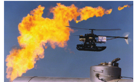
Figure 1. A Hazard From The International Aerial Robotics Competition

An IARC mission is often very complex. For example, this past year's competition required the unmanned aerial vehicles