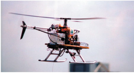
Figure 4. Georgia Institute of Technology Helicopter at International Aerial Robotics Competition